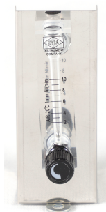
&lt; Nitrogen flow meter &gt;