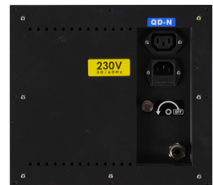
&lt; QDN &gt;

QDN digital nitrogen controllers are used to control the filling of dry air into the cabinet. So the desired relative humidity in the nitrogen cabinet / nitrogen box can be reached with most efficient dry air utilization. For example, if 5%RH is the required condition, then dry air will stop filling when 5%RH is reached. The dry air can be nitrogen, CO 2 or inert gas. However, nitrogen is the most commonly used gaseous matters to be used for drying the air. Traditional nitrogen cabinet / nitrogen box make the N 2 flling into the cabinet continuously, unable to stop. However, with our newly NC-2 controller adapted, more than 50% of N 2 can be saved immediately.